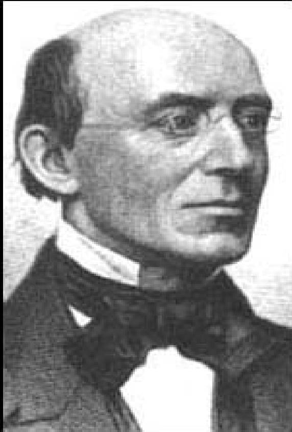
WILLIAM LLOYD GARRISON